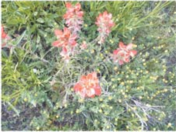
Indian Paintbrush, Castilleja spp.

B is on your left. Continue on Hwy. 64, just past the B & B on your right is the “Pioneer Park”, with its monument to “Joe Roughneck”. Erected in 1956 by Lone Star Steel this memorial is dedicated to the working men in the oilfield. It has an encasement to be opened in 2056. The park contains a replica of a wooden oil derrick used to drill the discovery well. Continue on Hwy 64 until you come to State Hwy 42 (a blinking traffic light). Turn right on Hwy 42 and continue on until you reach New London.