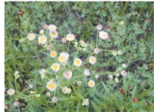
Fleabane Daisy, Erigeron pilaclephicus

Or you may continue on CR 3105 / FM3231 until it again becomes FM 1798 when it crosses U.S. 79 North, and follow that road south to the intersection of U.S. 259 South, where you can join the southern arm of Itinerary No. 3.