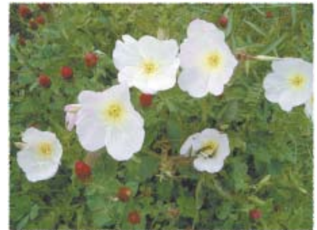
Showy Primrose (Buttercup), Oenothera Speciosa

Continue on SH 323 (1.2 miles) until you come to County Road 4136 on your left (you will see a brown Historic Sign Marker on your right) Turn left down the winding blacktop (oil service road), and continue for 1.6 miles until you come to a white pipe fence on the right. There you will see the historical marker which marks the site of the Daisy Bradford No. 3 and the original Discovery Well which began the Great East Texas Oil Boom of the 1930's. The Daisy Bradford was the third attempt by C.M. (Dad) Joiner to bring in a producing well in this area. The well blew in on October 3, 1930. Continue Down the oil road until you get to a "T" intersection. Turn Left on CR 4105, go .3 mi. then veer to the right continuing on 4105 all the way to State Hwy. 64. Turn right on 64, you will be in Joinerville. The Stroud House B &